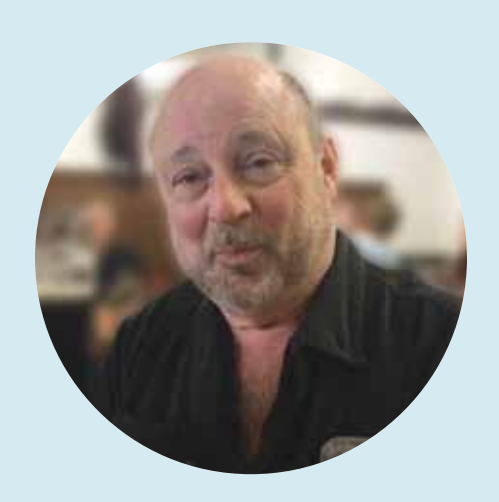
44 HGH IS MY HOSPITAL AND THEY HAVE BEEN THERE FOR ME WHEN I NEEDED THEM. 99