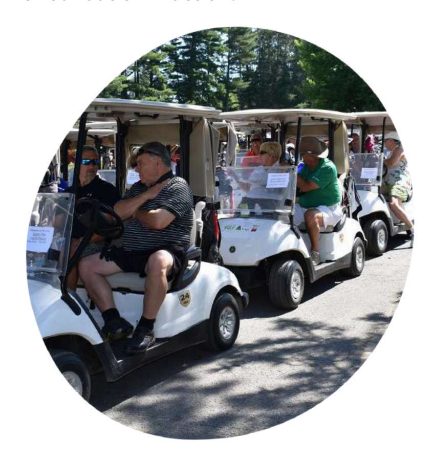
The Golf Classic - one the Foundation's key events - raised $55,000 at the 40th Anniversary edition in 2022.