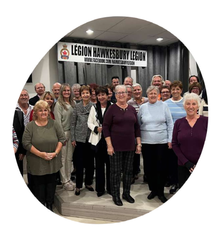
The Foundation thanked its volunteers during a recognition event in October 2022.