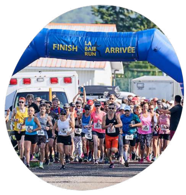
In July 2022, over 350 participants ran or walked and raised $55,000 for the HGH Foundation. Thank you to the organizing committee!

Every year, people and groups in the community organize events with the proceeds going to the HGH Foundation. What a wonderful way to support our hospital and its foundation. Thank you so much for your support!