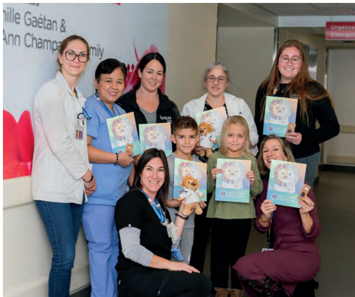
The distribution of the colouring sets began last November, much to everyone's delight!

This initiative would not have been possible without the financial support of two of the region's school boards, who sponsored 66% of the funds needed to carry out the project. By participating in this way, the Public and the Catholic French school boards of Eastern Ontario perfectly illustrate the spirit of solidarity and goodwill that animates the entire HGH community.